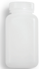
BOTTLE OF LIQUID (PRESERVATIVE)

Patients can watch a short, helpful video on how to use the collection kit at CologuardTest.com/use .